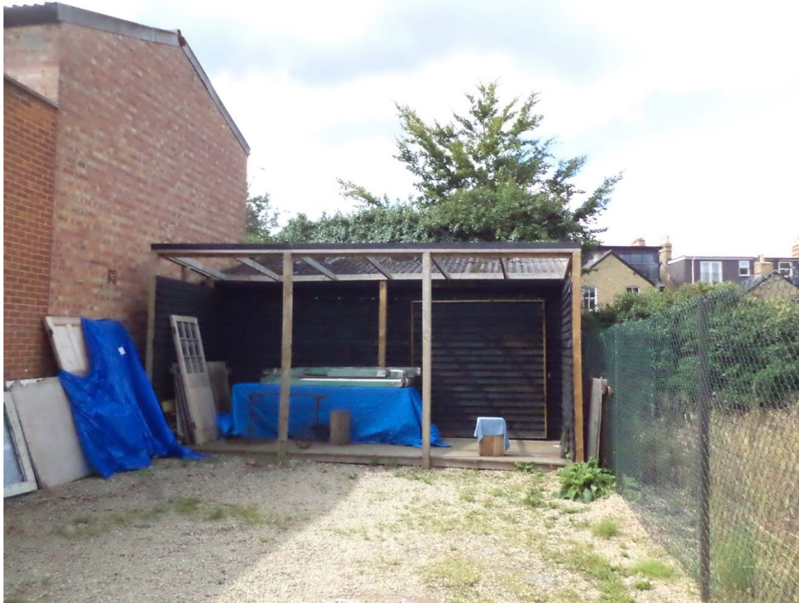
Service yard and store at 223 Banbury Road and two storey extension at 221 Banbury Road