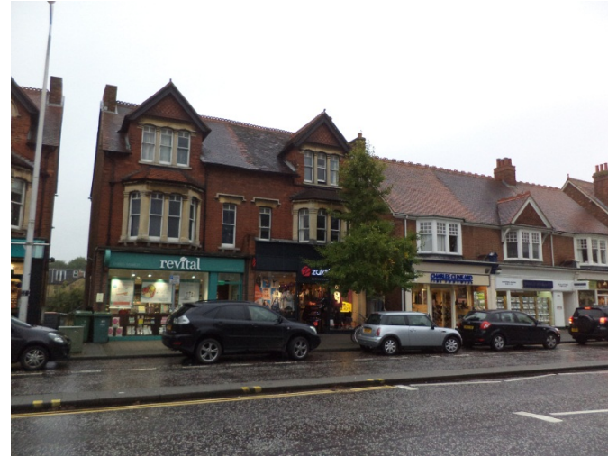
Access between 227-229 Banbury Road

Views from Banbury Road towards the site