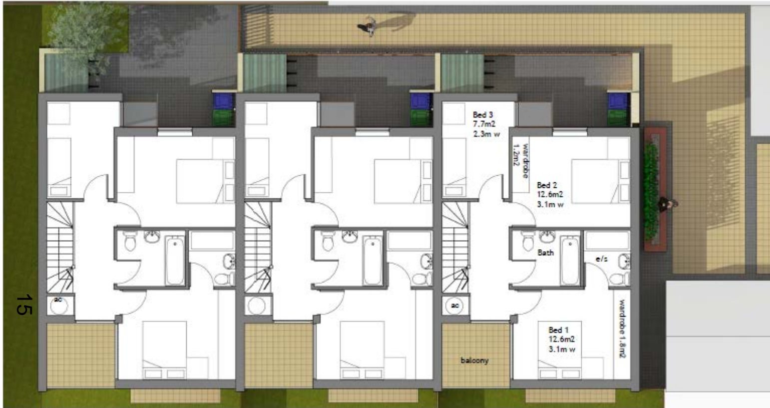
First floor plan 1:100