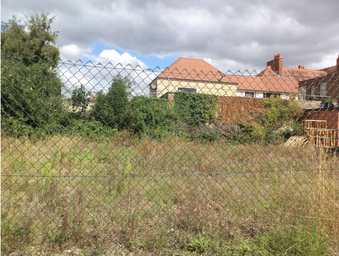
View towards north