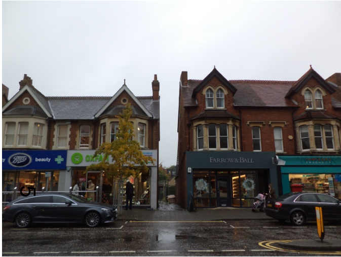
Access between 223-225 Banbury Road