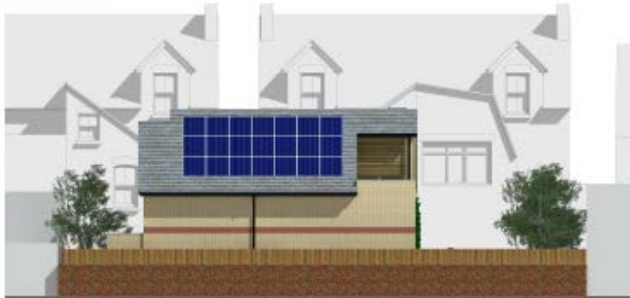
Elevation to West