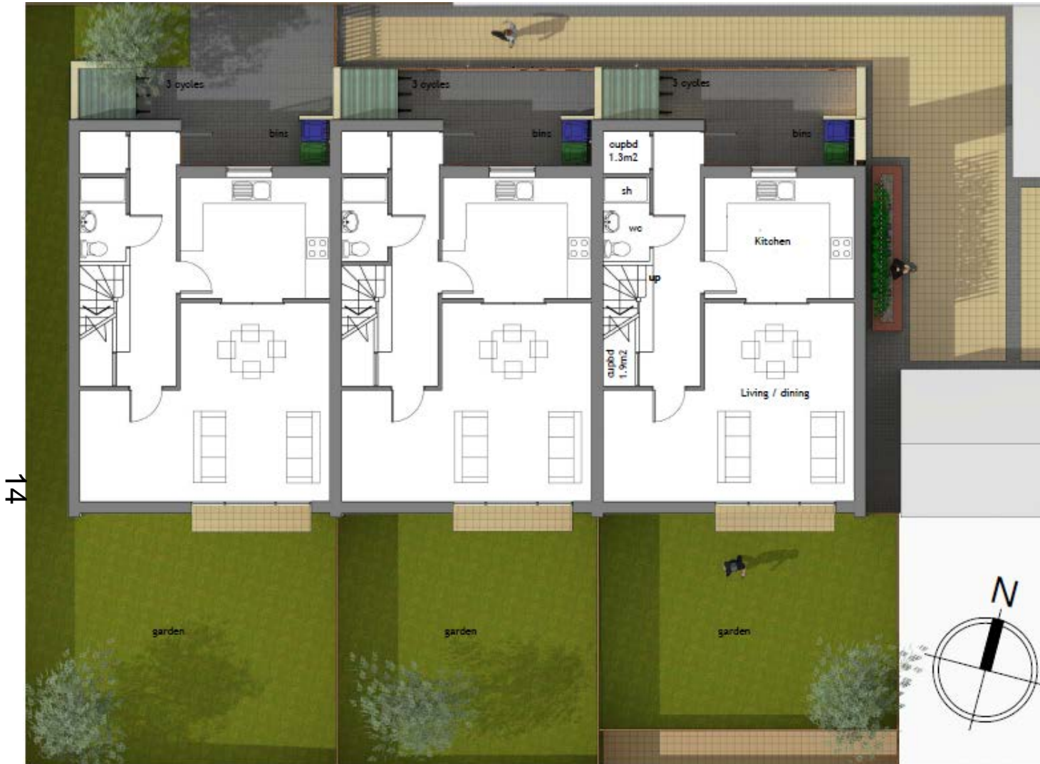
Ground floor plan 1:100