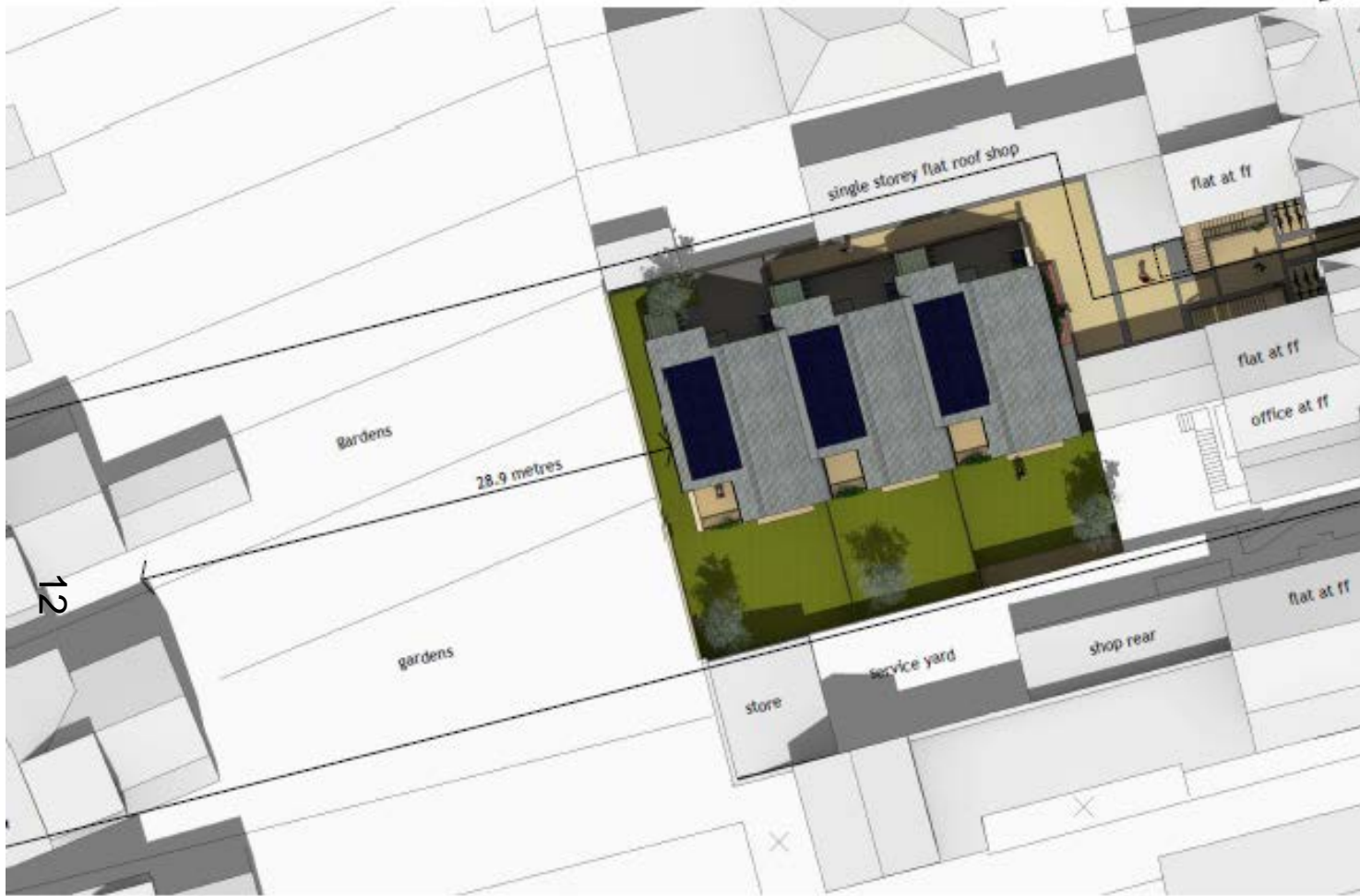
Distance from the properties along Stratfield Road