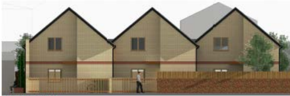
Elevation to North