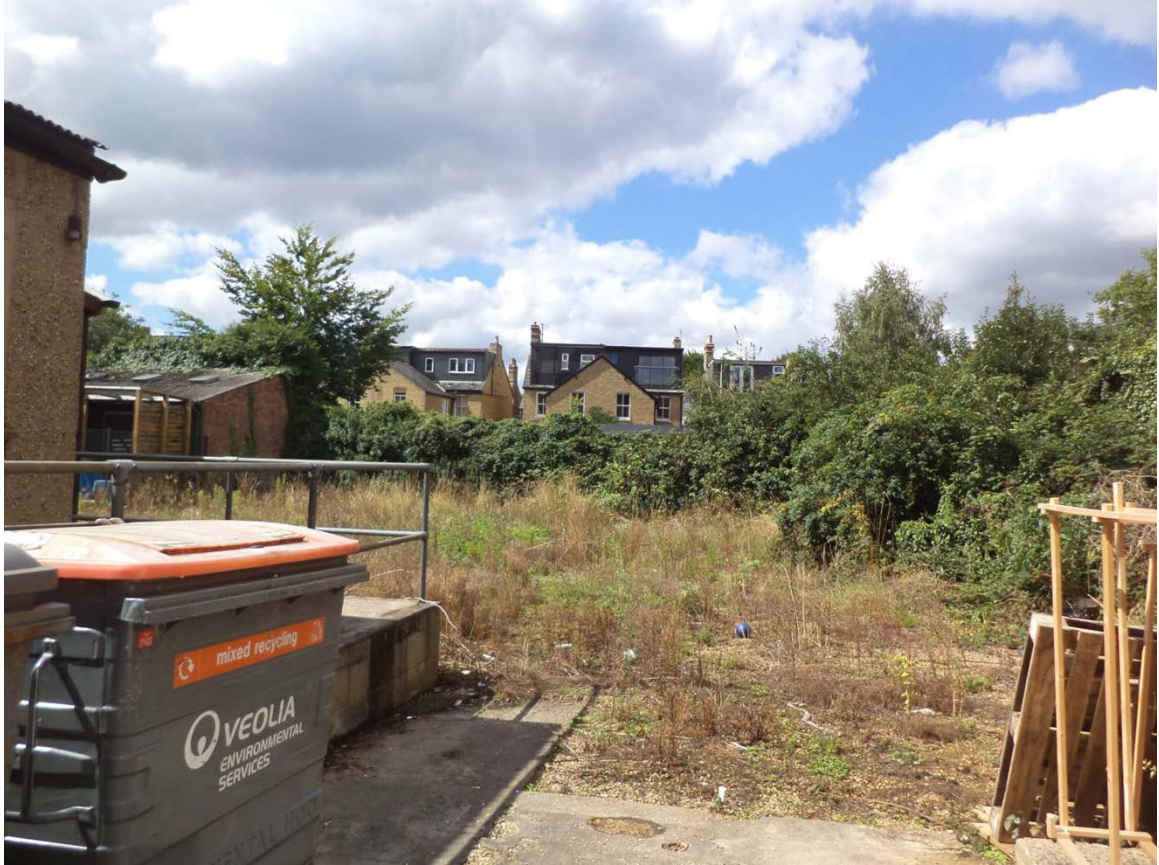
View from within site toward to western neighbours