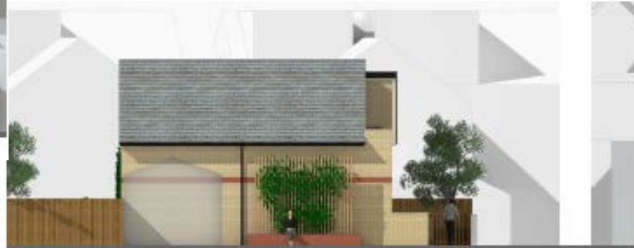
Elevation to East