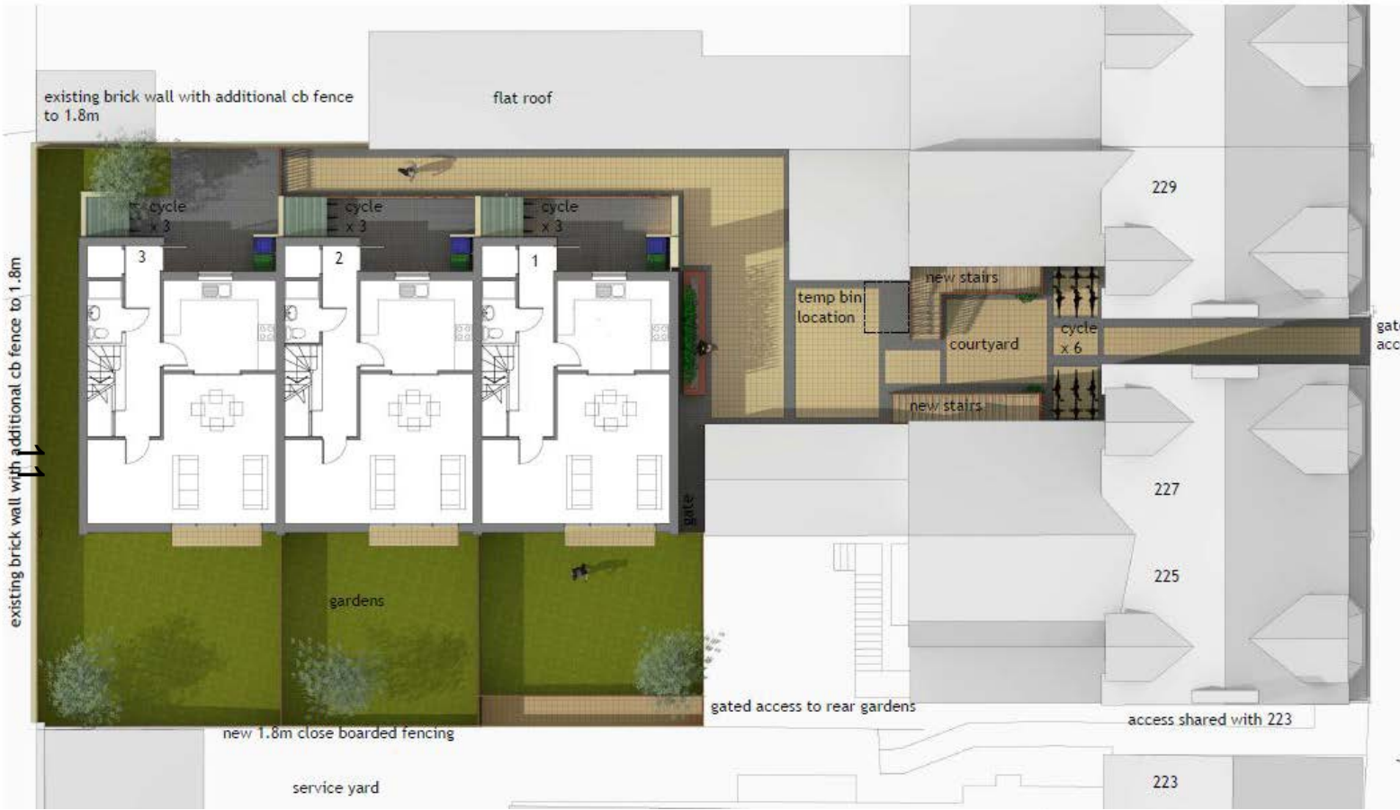
Proposed block plan