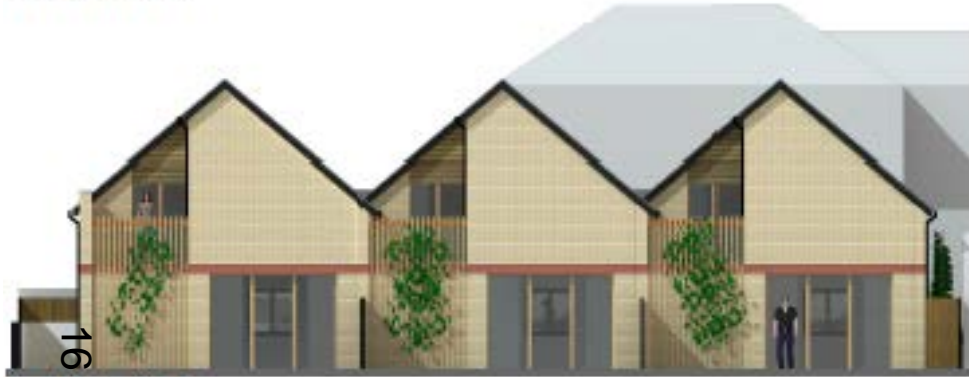
Elevation to South